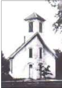
First Congregational Church 1873