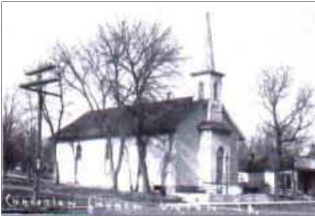
First Christian Church 1877 NW corner of Main and Commercial