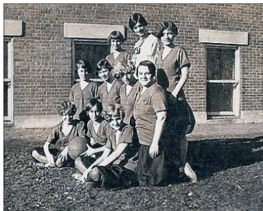
Union Consolidated School Basketball Team 1925-26