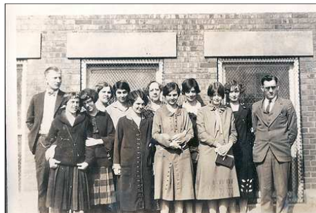
Union Consolidated School Faculty 1925-26