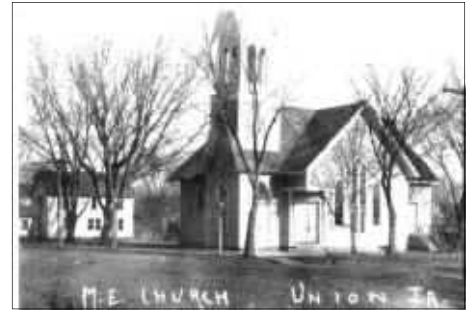
Methodist Church 1877