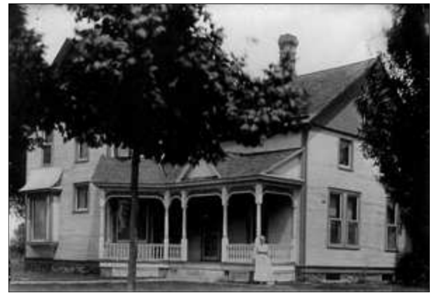
Carl Rogers home later