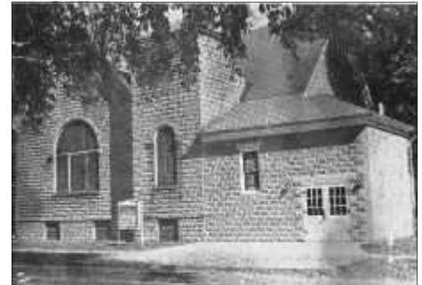
Community Church 1953