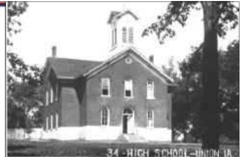
Second Union School Building. Erected 1875 Addition built 1892. Burned 1910