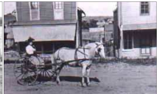
Main Street, South of Center looking East, about 1895 or 1896