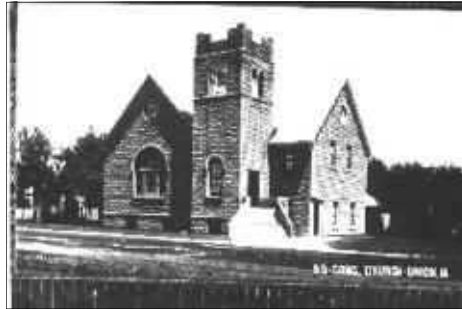
Second Congregational Church 1908