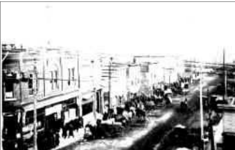
Center Street looking East