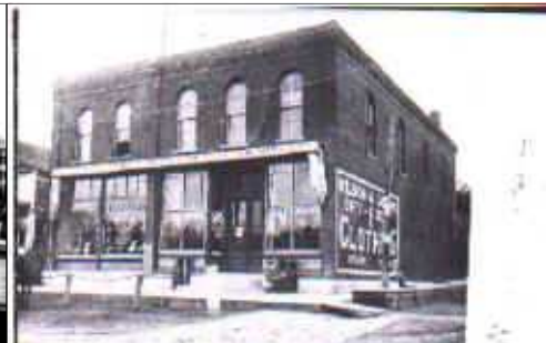
SW corner of Main and Center. Wilson and Chapin store from 1895 to 1912