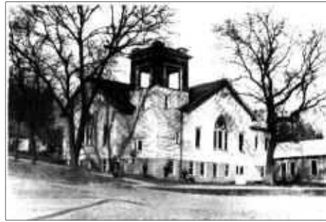
Christian Church NW corner of Main and Commercial, Built 1877, Rebuilt 1911