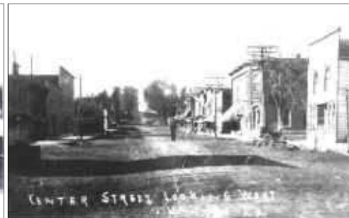
Center Street looking West